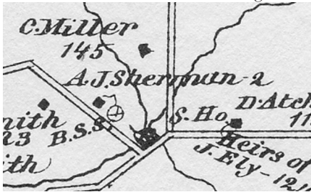
Detail from 1875 map of Hopewell showing the location of the Pleasant Valley district schoolhouse about the time it was repaired or replaced. The blacksmith shop is still in operation but the gristmill no longer appears on the map.

In 1870 the schoolhouse was only in fair condition and valued at $300. So, it was probably one of those schoolhouses that three years earlier was a frame building, not well ventilated, having insufficient grounds, and, if not unfit for use, perhaps close to it. The total cost for running the school was $199.38 and this money came from state appropriations ($20.84), the Hopewell Township tax ($102.00), and tuition ($76.54). It was not yet a free school and of the 63 eligible children only 56 enrolled, leaving seven who attended no days of school. Four students attended less than four months, nine attended between four and six months, 30 attended seven or eight months, and only 13 students attended the full year. While the average daily attendance in the old building was given as 46, this is undoubtedly a typographical error and it was more likely 16. This would be in line with reports for the next two decades when the average daily attendance fluctuated from 12 in 1871 to 19 or 20 in the mid-1870s to mid-80s. The next highest reported average attendance was 28 in 1883.