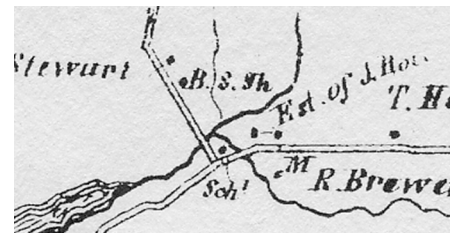
Detail from 1860 map of Hopewell showing the location of the Phillips Mill schoolhouse in the same wedged location as in 1849. The blacksmith shop is still in operation but the gristmill may have closed down by this time.

In 1867 a state-wide census of school age children was made and reported by township and district in the state superintendent's annual report. This census tells us that the name Phillips's Mill was being used for the district in Pleasant Valley and reports there were 64 children of school age, ages five to 18, in the district. It isn't until 1870 that the annual reports begin to give specific information for local districts, and in this year we first find the name of the district given as Pleasant Valley, replacing Phillips's Mill since the mill had evidently closed down some years earlier and was no longer a landmark. About this time school district boundaries were revised and clarified. Fifty-four districts were designated in Mercer County, with the Hopewell schools given numbers 1 through 14 and the Pleasant Valley district designated District No. 1. This activity was associated with an 1867 act by the legislature to "Establish a System of Public Instruction" that repealed all previous acts and established a new system. A major part of this plan provided for the appointing of county superintendents to work with the various district committees and township superintendents. That year the state superintendent noted in his report that there was more interest on the part of teachers to improve teaching methods, teacher salaries were increased, there was more uniformity of textbooks,