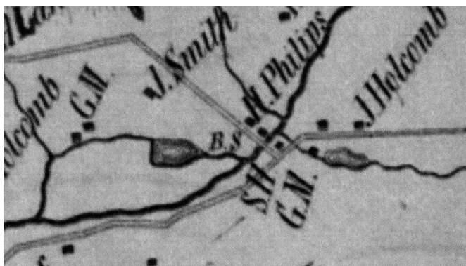
Detail from the 1849 Otley and Keilly Map of Hopewell Township showing the location of the Phillips's Mill Schoolhouse wedged between the road and Moore's Creek at the intersection of Pleasant Valley and Valley Roads.